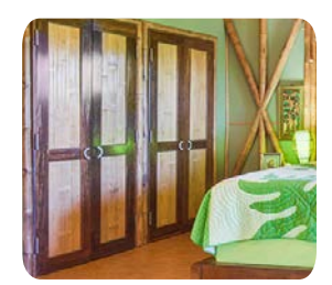
interior closet doors