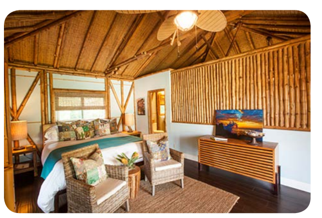
Signature Zen 768 bedroom with woven bamboo ceiling.