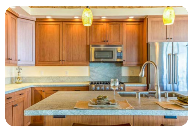
Contemporary, spacious kitchen with high-end finishes.