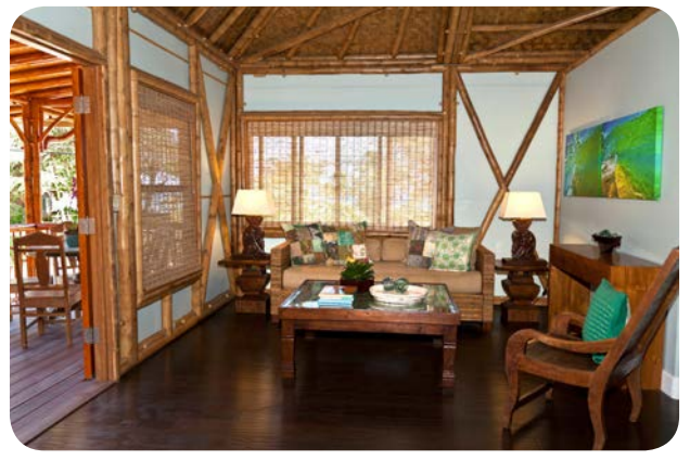
Signature Bali 576 sitting area with painted walls.