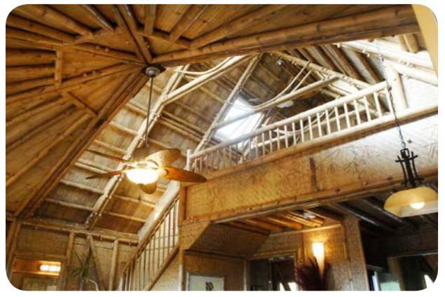
View of loft and beautiful exposed bamboo trusses.