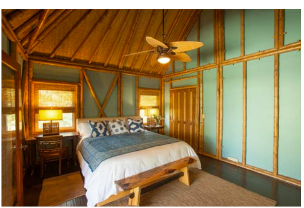
Signature Poly 1619 bedroom with woven bamboo ceiling finish.