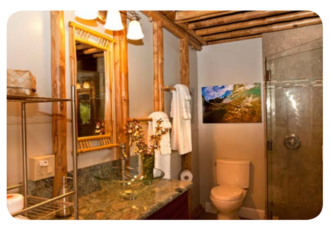
Master bath with beautiful exposed bamboo.