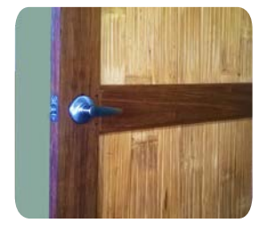
interior bamboo doors