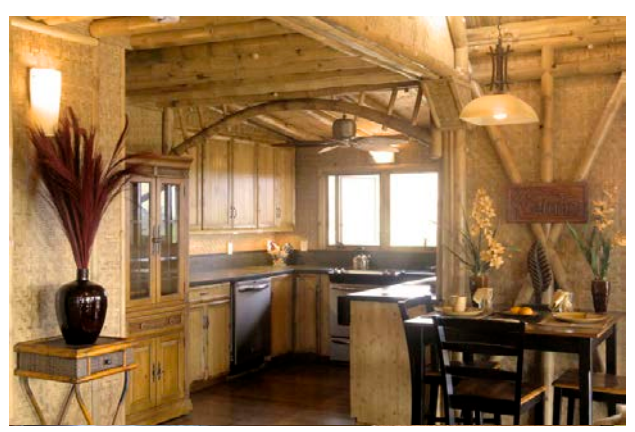
Signature Pacific 992 kitchen with woven bamboo wall finish.