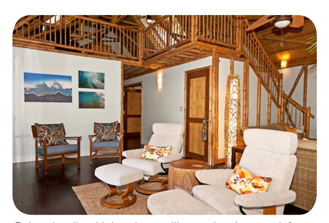
Painted walls with bamboo ceiling and stairway to loft.