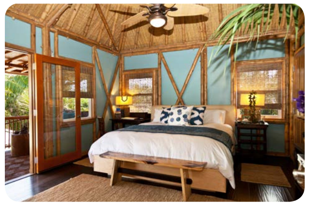
Master suite with woven bamboo ceiling and painted walls.