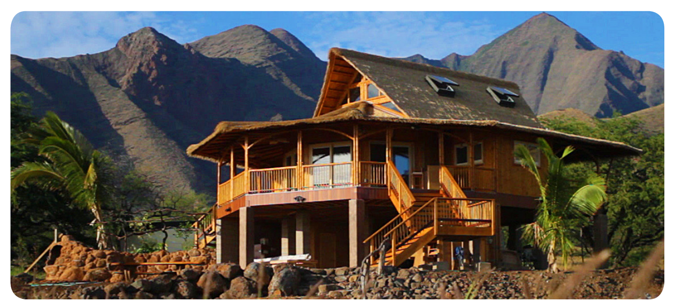
Signature Pacific 992 with synthetic thatch roofing and skylights, on post and pier foundation.