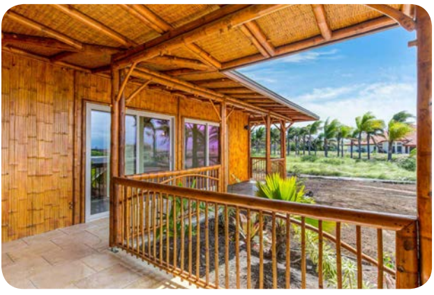
Split bamboo siding and loose weave porch ceiling finish.