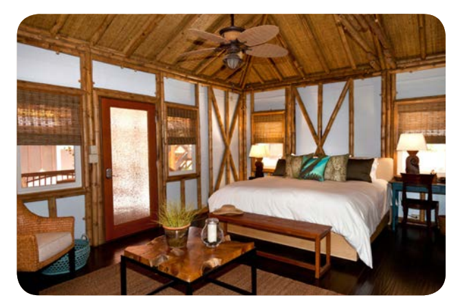
Signature Zen 400 studio with woven bamboo ceiling.