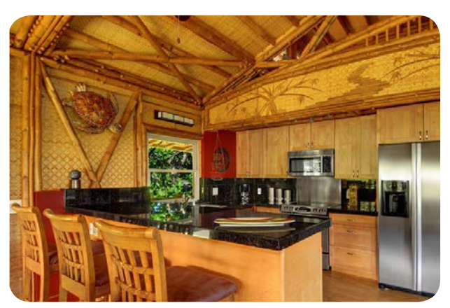
Kitchen with custom bamboo artwork above cabinets.