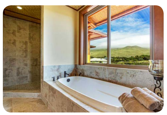
Beautiful views from the master bath garden tub.