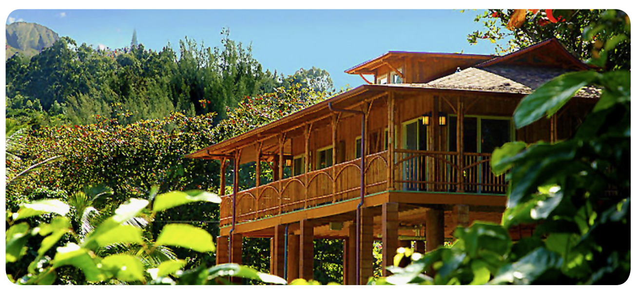
Custom Signature Bali on raised 17' tsunami foundation. 2 bedrooms, 2 baths, and a private residential elevator.