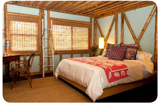
Guest bedroom with exposed bamboo x-braces.