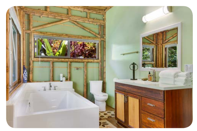
Bath with painted walls and bamboo cabinets.