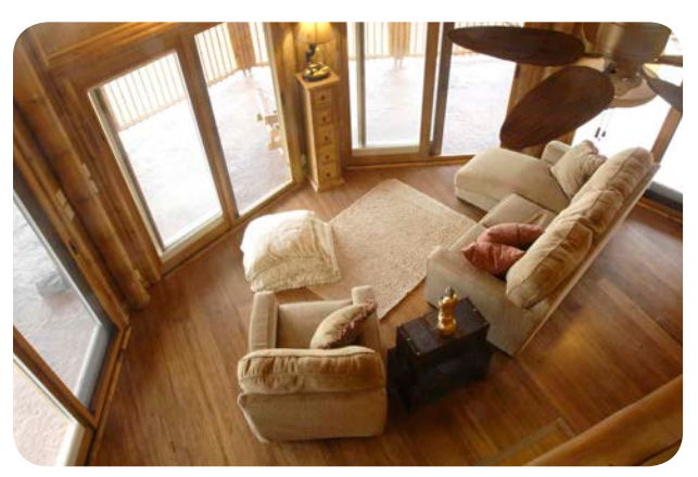
Loft view of living room. Sliders open to wrap-around lanai.