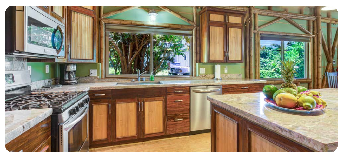
Custom Signature 2-Story Bali. 3 bedrooms, 3 baths with a total of 2082 sf interior and 862 sf covered porch.