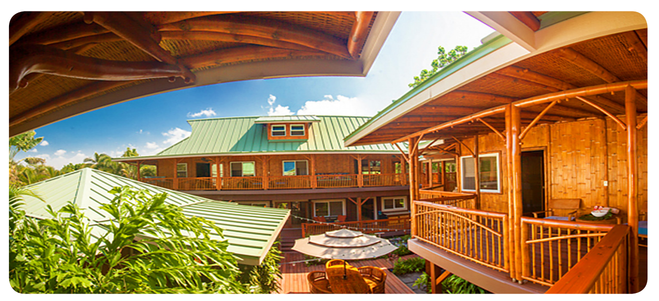
Multi-unit luxury vacation rental property comprised of four Bamboo Living structures connected by walkways.