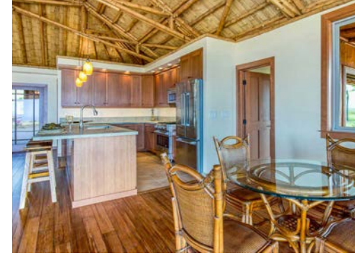
Hybrid Villa 1950 great room with split bamboo ceiling finish.