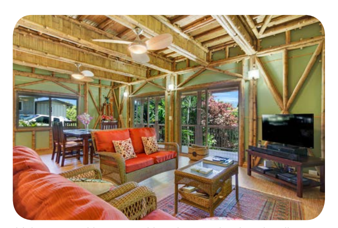
Living area with exposed bamboo and painted walls.