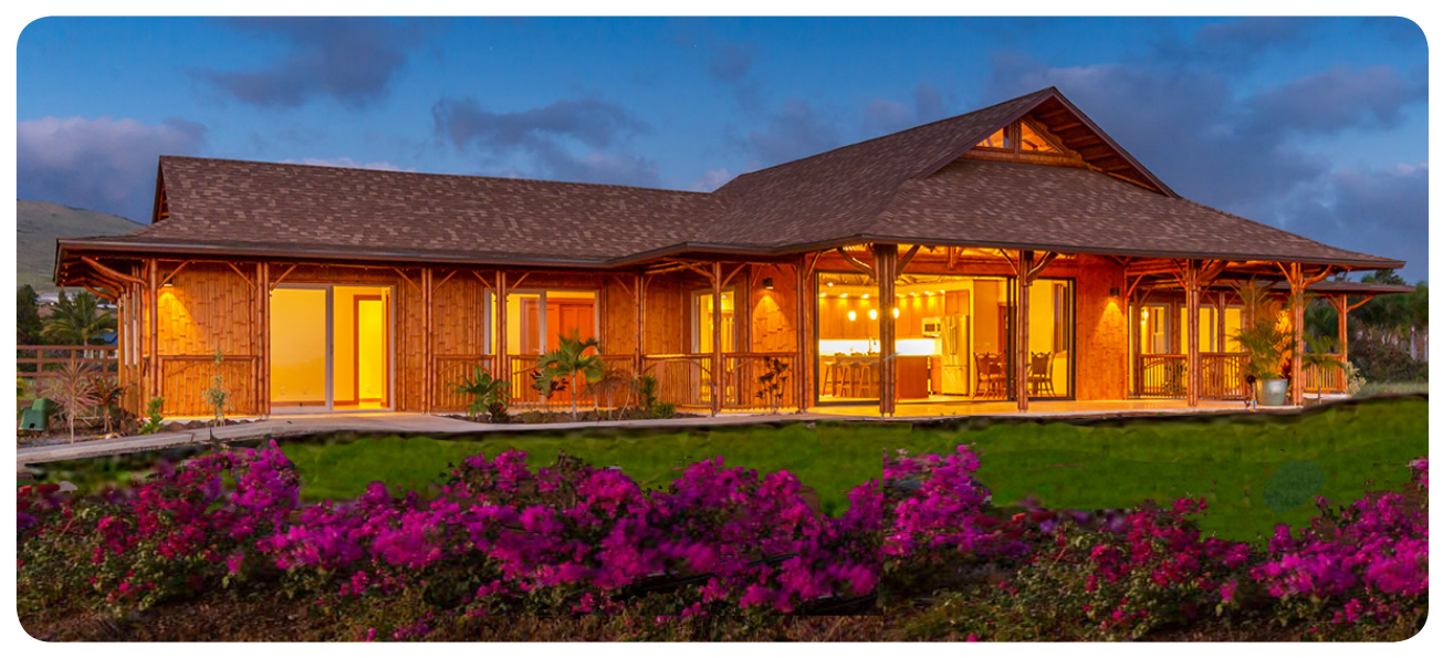
Hybrid Villa 1950 - 3 Bedroom, 2.5 Bath. Central great room opens to a generous lanai with travertine stone floor.