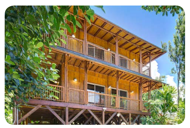
Exterior view with spacious covered porches.