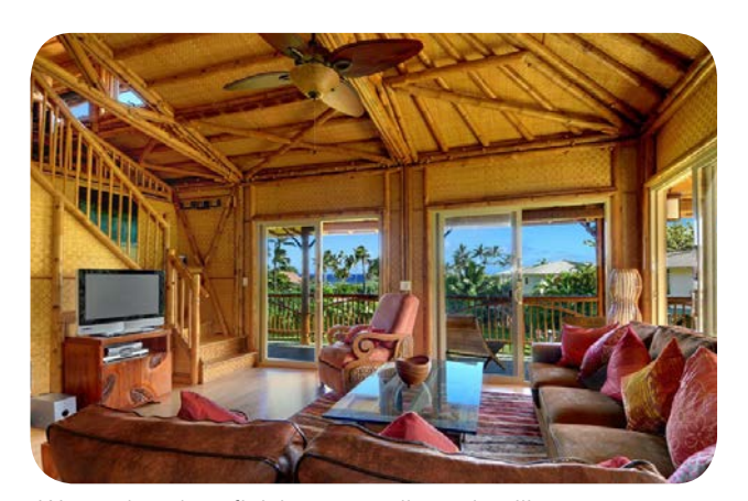
Woven bamboo finishes on walls and ceilings.