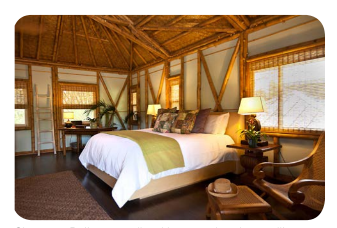
Signature Bali 576 studio with woven bamboo ceiling.