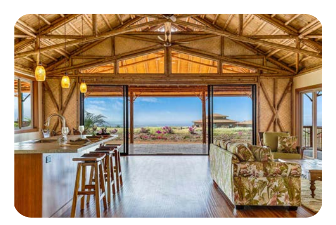
Split bamboo ceiling finish with exposed bamboo trusses.