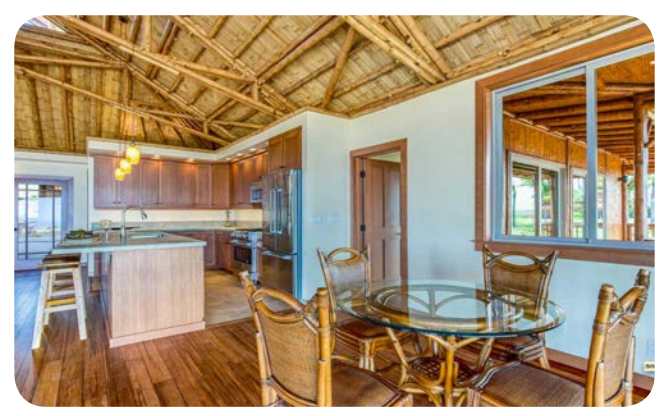
Hybrid Villa 1950 - conventional walls with split bamboo ceiling finish.