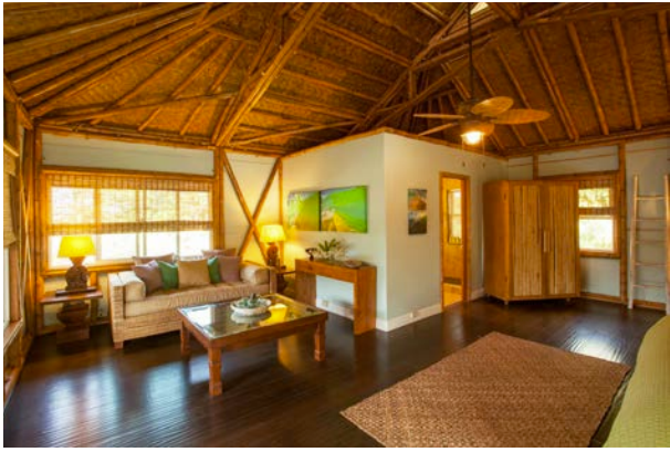
Signature Bali 576 living area and corner bathroom.