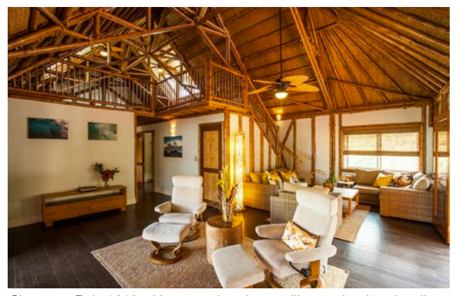
Signature Poly 1619 with woven bamboo ceiling and painted walls.

784 SF Porch Hybrid Bamboo Home Package $159,275 275 SF Loft Signature Bamboo Home Package $198,440