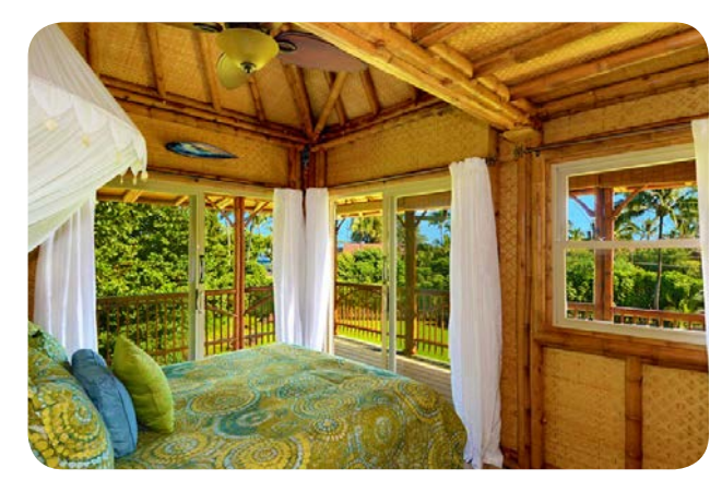
Guest bedroom with lanai entrance and expansive views.