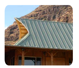
flying gable roof