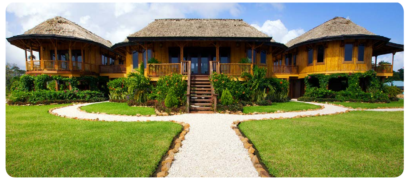
Signature Celestial 3 with thatch roofing.

Signature Home Packages are great for temperate climates with building codes that allow single-wall construction. Your package includes bamboo-framed exterior single-wall panels, complete with our natural split bamboo exterior siding. Select your interior wall finish, either: paint color of your choice, woven bamboo, or split bamboo, and enjoy beautiful exposed bamboo throughout.