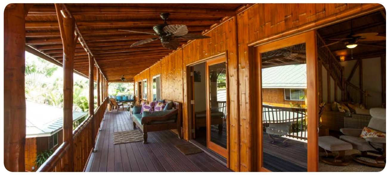
Signature Polynesian 1619 front porch with split bamboo exterior siding, bamboo porch posts, railing, and pickets.