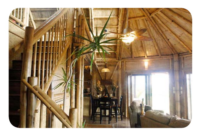
Split bamboo ceiling finish and woven bamboo walls.