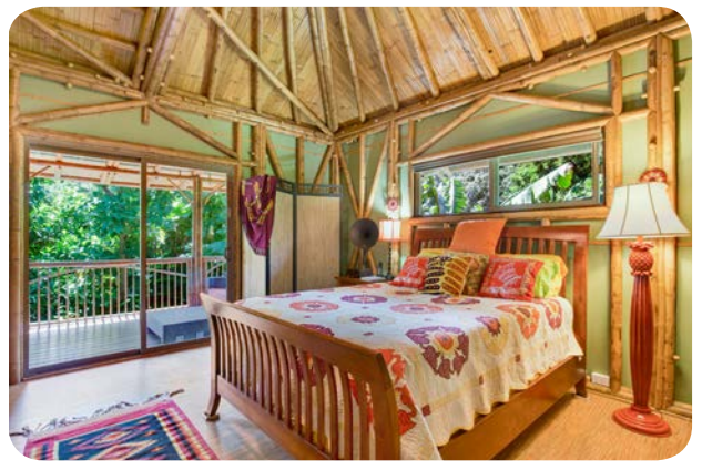
Guest bedroom with split bamboo ceiling finish.