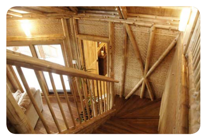
Stairway from loft with woven bamboo interior wall finish.