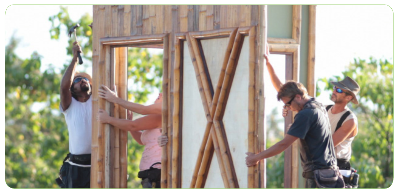
Contractors assembling the Bamboo Living exterior wall panels of a Signature Home Package.

EXCLUSIONS The following materials and services are not included in your Bamboo Home Package. You may handle these items on your own or hire a builder/contractor to handle them for you.