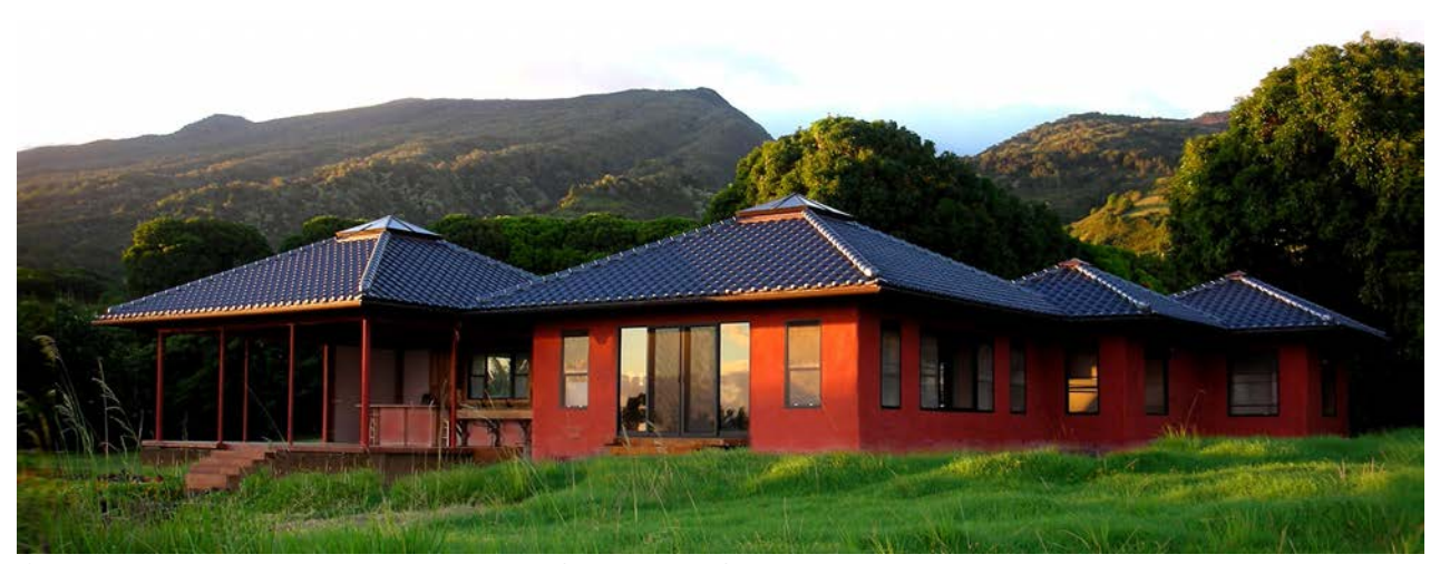
Custom bamboo home with Japanese glazed tile roof, Italian stucco finish, and exposed interior vaulted bamboo ceiling.