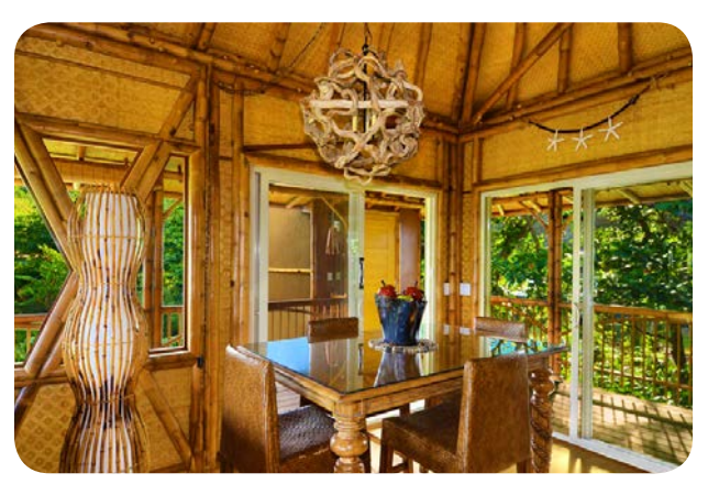
Dining area with exposed bamboo x-braces and trusses.